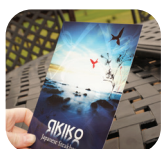
Varnish & Aqueous Coat