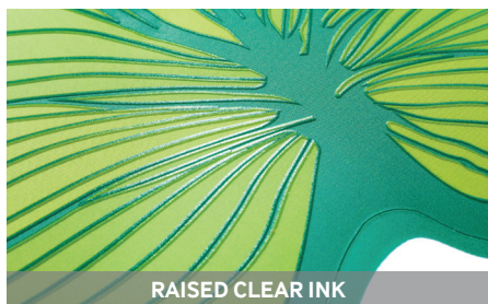
RAISED CLEAR INK