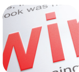
Emboss & Hot Foil Stamp