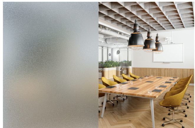
Frost ● ● ● ● ● ● ● ●