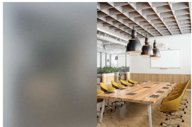
Light Etch ● ● ● ● ● ● ● ●