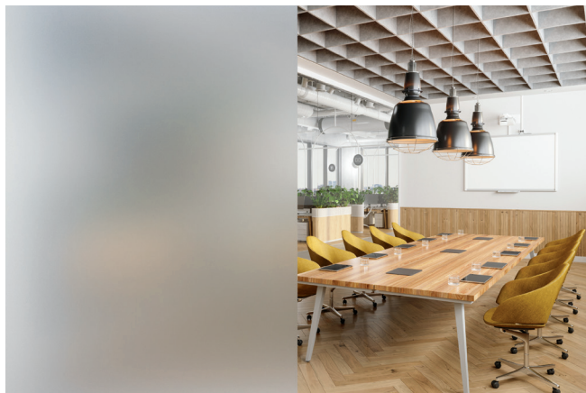
Dusted Crystal ● ● ● ● ● ● ● ●